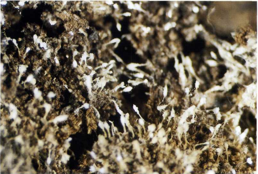
Riessia semiophora in nature, groups of synnemata, (BCC Myc. MC234).