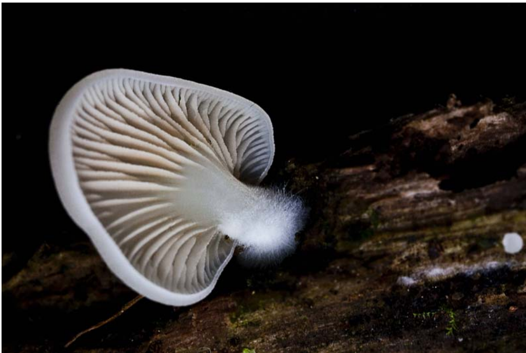
Fig. 3. Cheimonophyllum pontevedrense (holotypus, LOU-Fungi 19578).