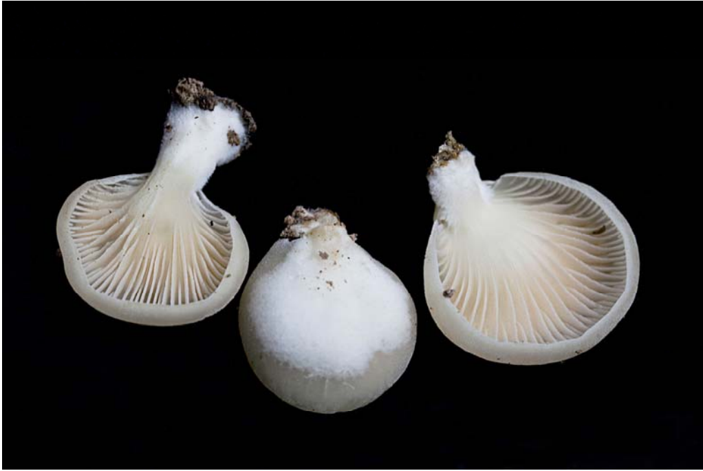
Fig. 2. Cheimonophyllum pontevedrense (holotypus, LOU-Fungi 19578).