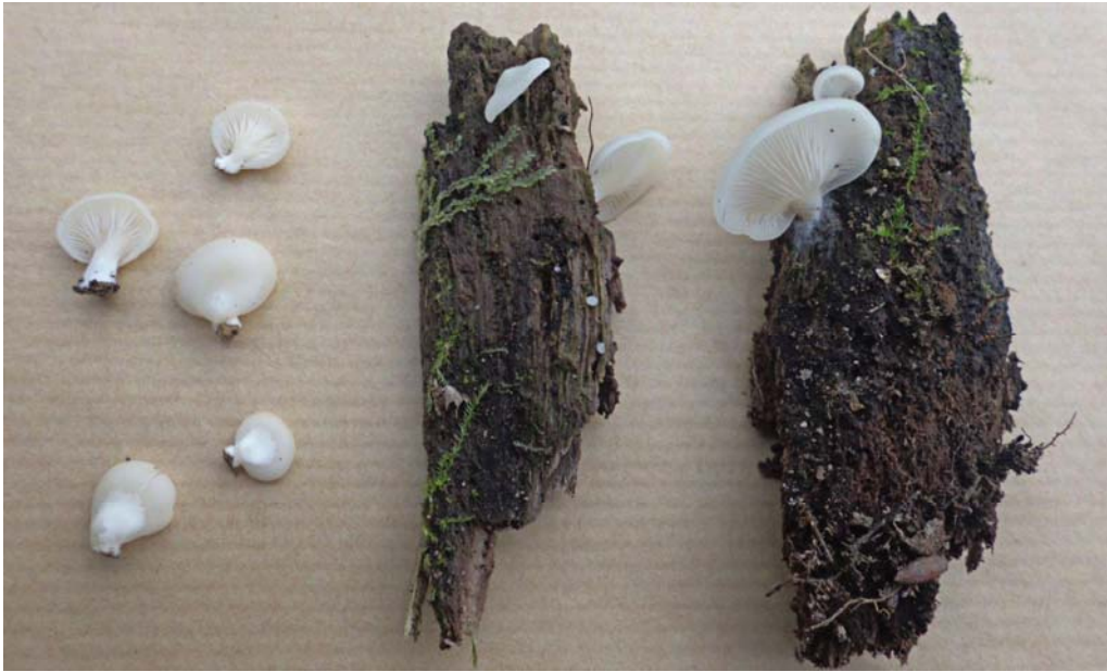
Fig. 1. Cheimonophyllum pontevedrense (holotypus, LOU-Fungi 19578).

and dried specimens. Microscopic observations were recorded with standard methods, using sections mounted in a solution of 1% Congo Red in water, 3% KOH or Melzer's reagent. Spore sizes are given in approximation to 0.5\ \mu\text{m} , with extreme values given in parentheses, followed by the length-width ratio of the spores (Q). Microscopic structures were drawn with help of a drawing tube. The collected material has been deposited in LOU-Fungi herbarium (Centro de Investigación Forestal de Lourizán, Pontevedra, Spain).